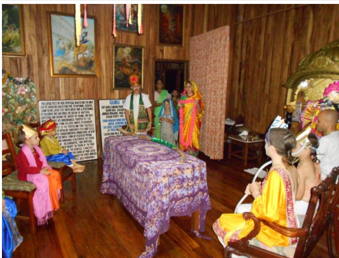
ABOVE: CHILDREN'S DRAMA ON RAMA NAUMI

Prabhupada: That may be. But this should be our aim. We should not be attracted by the modern city life. Simplified life. Save time and utilize for advancing in Kṛṣṇa consciousness. That is perfect life. Just like Vṛndāvana. Vṛndāvana life means agriculturist, cowherd boys, uneducated girls, cows and calves, and tree, fruits. This is Vṛndāvana. The center is Kṛṣṇa.