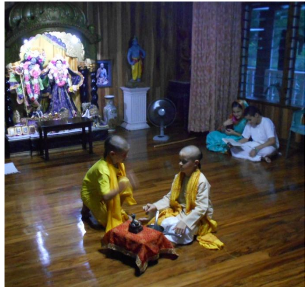
ABOVE: GAUR PURNIMA DRAMA

their senses whatever desired within minutes at most. It is today a consumeristic, materialistic, and instant gratification society.