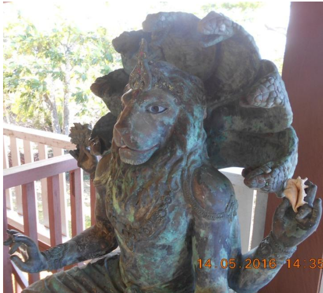
ABOVE: LORD NARASINGHA

gardening... People feel at home when they can smell the exhaust fumes and hear the traffic day and night, when they can press a button to become more comfortable, and they can feed